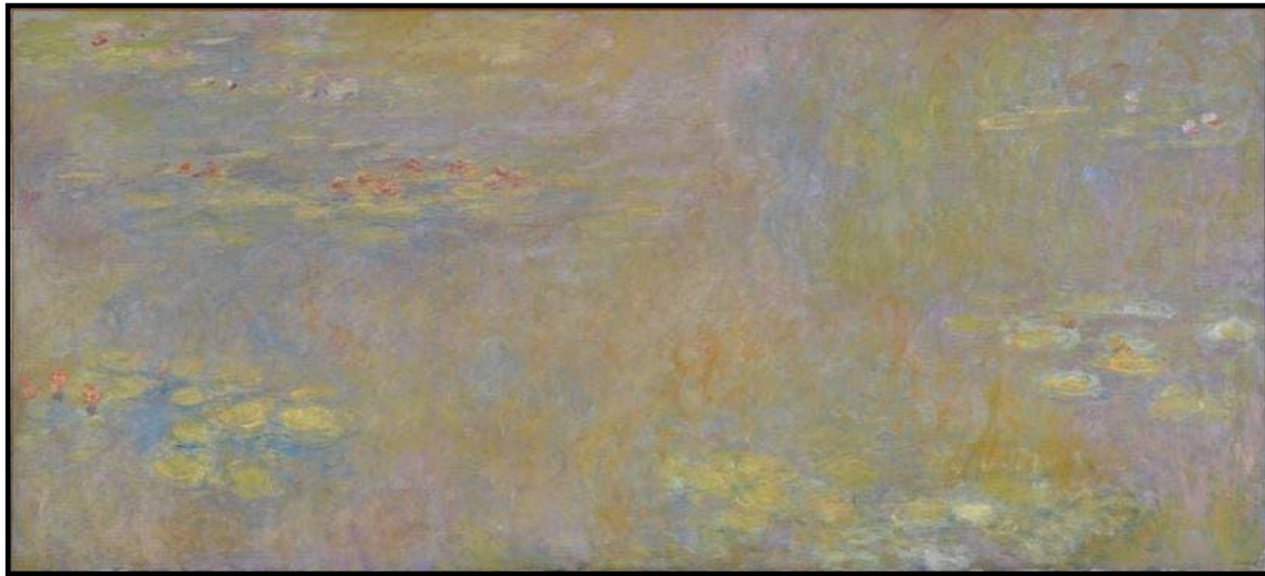
Claude Monet “Water Lilies” (painted after 1916) National Gallery, London

“Peace, peace,’ they say, when there is no peace.” [Jeremiah 6.14]