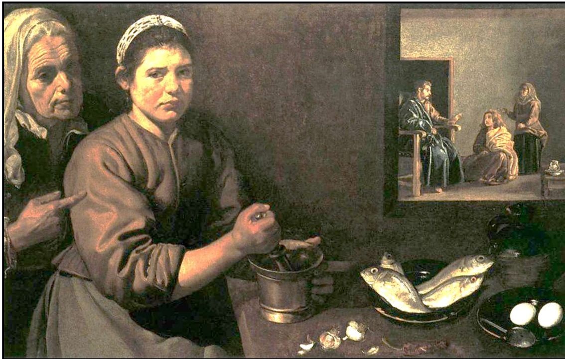
Diego Velazquez – “Christ in the House of Martha and Mary” (1618) National Gallery

As Christians, disciples of Jesus, when is the right time to roll our sleeves up and take action in building God’s Kingdom? And, when is the right time to stop, and to be still in his presence, listening for the whisper of his voice, sitting quietly at his feet? What is the right balance between action and stillness?